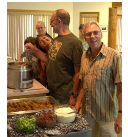
In the Dining Room

People joined together to make the retreat from Victoria to Campbell River on Vancouver Island. Many regulars, a few returning after several years absence, and some first timers, aged from 5 to 89 years old. It truly was a time of sharing, joy, creativity and discovery.