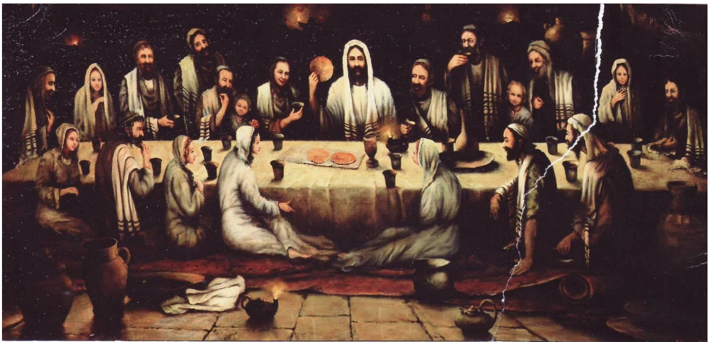
Men and Women at His Table

Finally, these words of Jesus, at His Table, are for us "Pilgrims of Hope": "Therefore, I do for you as my Father did for me by giving me the kingdom: you will eat and drink at MY TABLE in my kingdom." (Luke 22:29-30)